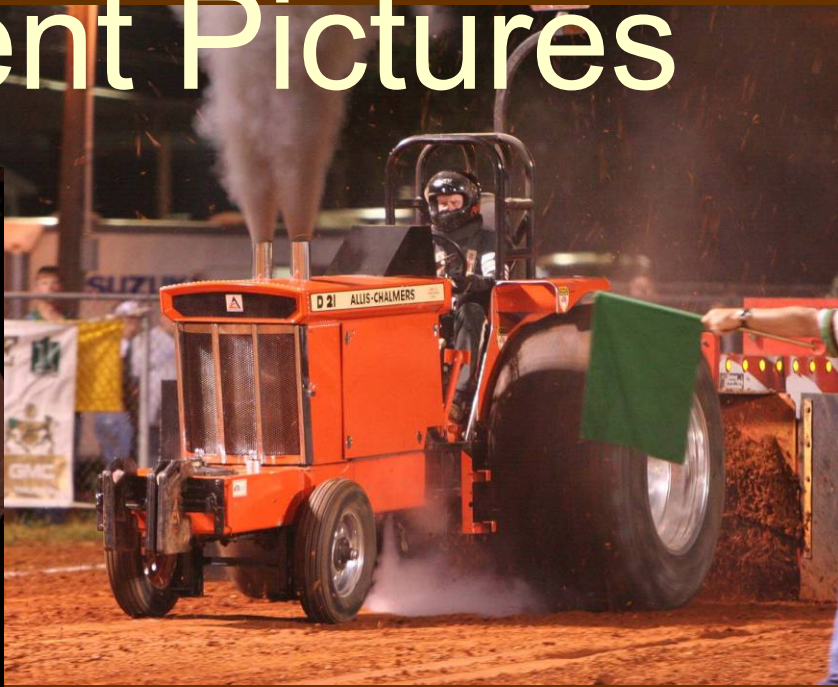
Above: Rain eventually won out in Lawrencebrug, TN as server weather moved through.